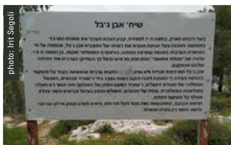
The local sign mentions the Mamluk period, April 15, 2019

Until 1967 this Maqam was the site of prayer and gatherings of the surrounding villagers from Yalu, Beit Nouba, 'Imwas and Bir Ayoub. People came there from other villages in the area as well, such as Beit Leekiya and Beit Sira. Following the 1967 occupation, the villagers were expelled and the villages destroyed.