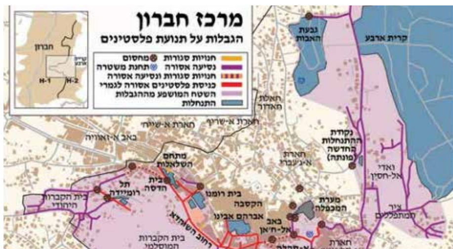
Map of Hebron city center and Restrictions imposed on Palestinians

In 2017 UNESCO recognized Al Haram Al Ibraheemi as a Palestinian world heritage site. As in Nabi Samuel, the Ministry of Religious Affairs declared equality in prayer arrangements for Palestinians and Jews. However, in actual fact the network of checkpoints and restrictions imposed by the Israeli army in the area limits the Muslims' approach for prayer in their sacred mosque.