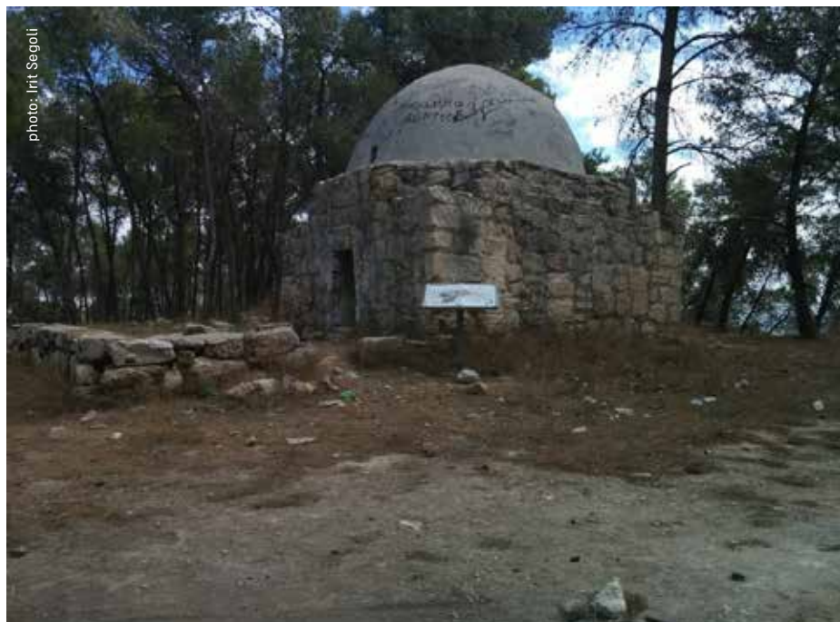
Maqam E-Nnabi Gheit in the Nabi Gheit nature reserve, 2017

The Maqam structure is square, with a dome on top, with no memorial mention, standing in the midst of ancient pine trees. According to local tradition, Nabi (the prophet) Gheit is responsible for opening the sky to rain, and in dry years the area's inhabitants used to come to the site to pray for rainfall. 13 Next to the structure is an ancient rock stage. The Maqam was restored about 15 years ago. A ruined waterhole and cave are situated on the eastern side of the hill.