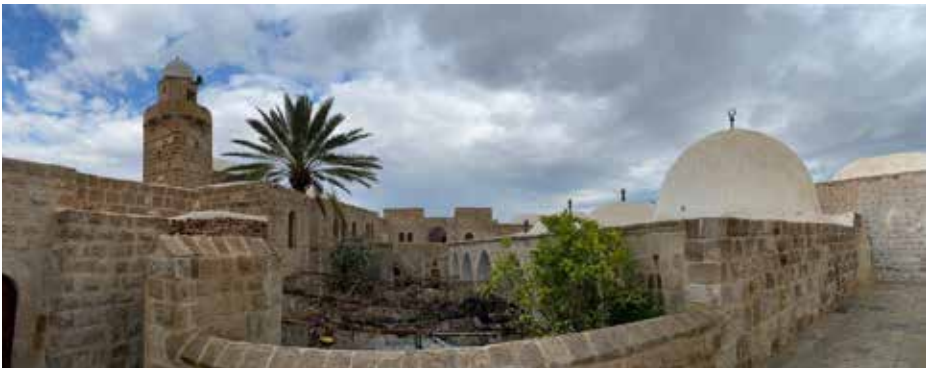
Courtyard at Nabi Moussa, 25.2.2020