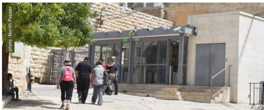
Side entrance for Palestinians, 3.7.2018