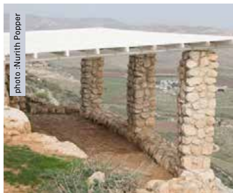
Rehav'am Ze'evi lookout at Qubbet A-Najme, 7.2.2018