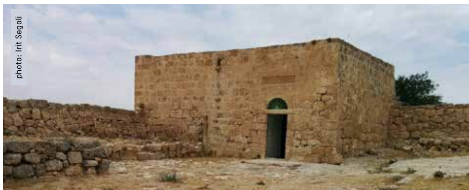
Maqam E-Nnabi Yaqeen, 21.6.2017