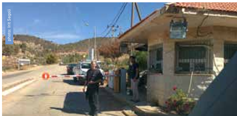
The gate of Alon More settler-colony, 27.9.2017