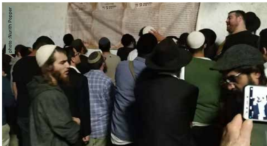
Wall of the grave building, 30.4.2019