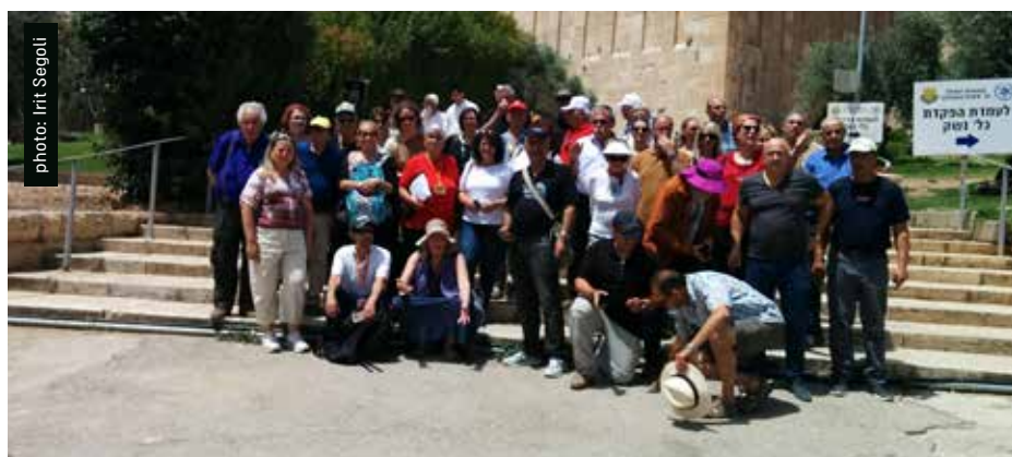
Being photographed in front of the entrance to the Cave of the Fathers, 3.7.2018