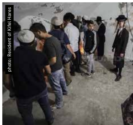
Inside the Maqam, near the gravesite, 4.5.2016

The gravesite compound is close to the entrance to Kifl Harith village. The structure is prominent. The tomb itself is spacious, its walls domed and whitewashed. A small structure is built next to it. The Maqam is surrounded by ancient trees. Next to the Maqam yard is a Muslim cemetery, fenced in order to prevent pilgrims from entering it during their celebrations. Still, on April 30, 2019, the gate of the cemetery was wide open and Jews used it to enter the Maqam yard.