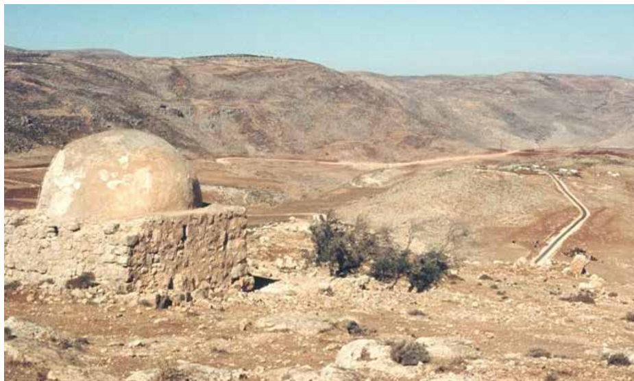
Maqam E-Ssit Zahara, 1975 (photo: Amikam Shuv. An identical black/white photograph appears in the Israel Guide of 1979), Park Ayalon-Canada 6

Maqam E-Ssit Zahara is included in the Kokhav Ha-Shachar nature reserve, declared as part of the Judea and Samaria area since December 17, 1984. It spreads over about 14,200 dunams. The Maqam is a sanctified tomb near the peak called Qubbet A-Najme (Star dome). entry of this nature reserve is through the Kokhav Ha-Shachar settler-colony. Out of bounds for Palestinians. The Maqam was built in honor of a local saint considered "patron of births and babies" 6 , and villagers of nearby Deir Jarir held pilgrimages and conducted traditional ritual ceremonies there. Archeologist Gideon Sulimani estimates that it was built about 400 years ago. Its walls are about 90 centimeters thick. Photographs of the Maqam from 1975 and in a 1996 publication show the structure and the dome on top as whole, whereas in a photograph of 2018 it appears ruined. When and how did this happen?