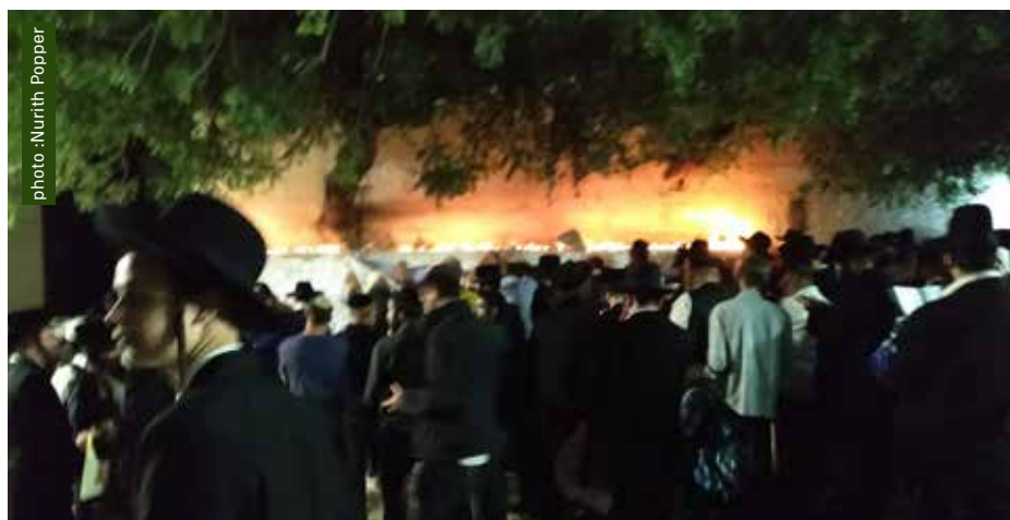
Crowds of Jewish observants near Joshua's Tomb, 30.4.2029

Close to Joshua's Tomb, in a commercial area near the market, the village council house is being built. The Maqam structure is not prominent among the other buildings around. Its entry is narrow. Women crowded in the street near the gravesite in an open area defined as the "ladies' section".