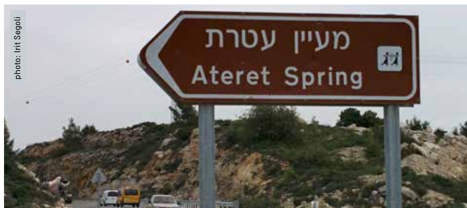
Road sign Ateret Spring on road 465, 22.3.2017

Unlike the Maqam, the spring nearby has been confiscated, and the settler-colony Ateret has overtaken it, and restored it accordingly. The name of the spring was originally 'En A-Zaghira, but the settler-colonists renamed it Ateret Spring. The sign on the road leads to Ateret Spring, named after the settler-colony.