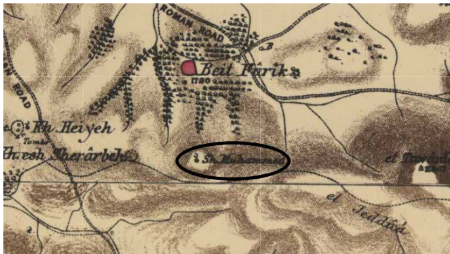
British survey map of 1880, showing Maqam Sheikh Mohammad

This Maqam is located on Mount Mohammad (Hill no. 851). The area is entered through Itamar settler-colony. It is out of bounds for Palestinians. The mountaintop overlooks the valley and the Palestinian village of Beit Furiq. The British survey map of 1880 shows Maqam Sheikh Mohammad.