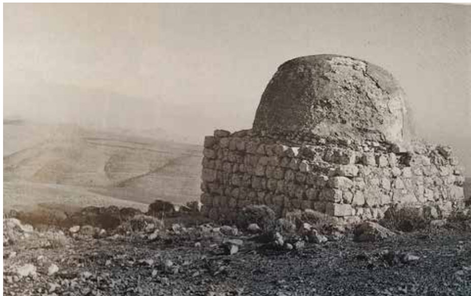
Maqam E-Ssit Zahara 9