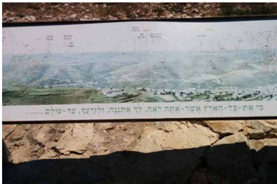
Map of the region showing settler-colonies only, July 13, 2016