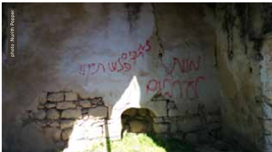
Nationalist slurs on the walls of a building close to the Maqam

The slurs "Death to Arabs" and "A state of Palestine will not come into being" are written on the walls of a very impressive but dilapidated villa near the Maqam. Its owner left the place when it was occupied in the 1967 war, and lives in Jordan (according to a Boureen villager).