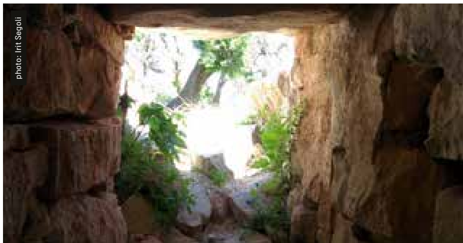
Entrance to the bottom floor, April 20, 2016