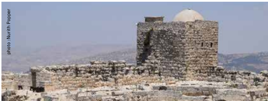
Maqam Sheikh Ghanem, July 27, 2016