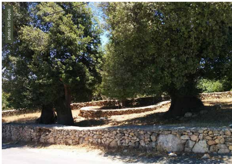
Ancient oak trees at the site that used to be Maqam Sheikh E-Nnabi Laimoun, 7.6.2017

The Israel Nature and Parks Authority has renamed the site the Alonei Shmuel nature reserve. It has not yet been approved. It covers 15 dunams.