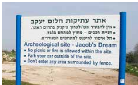
The archeological site is now called Jacob's Dream, February 7, 2018

The sign says: "Muslim Maqam of the early Muslim period". Information on the sign ignores the continuity of activity at the Maqam until its disruption by the 1967 Israeli occupation and gradual takeover of the area. J., resident of Dura Al-Qar'i village, told the MachsomWatch team members at his village on March 11, 2018: