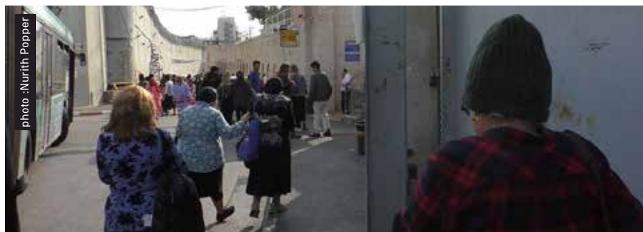
The sleeve of walls through which Rachel's Tomb is entered, 11.11.2018

Qubbet Raheel is situated in the northern approach to Bethlehem, south of Jerusalem. Early traditions, over 1,700 years old, identify the place as the burial site of Rachel, wife of Jewish Forefather Jacob, and it is thus sanctified by all three monotheistic religions. At present it is a prayer site strictly for holders of Israeli IDs or tourists – whereas Palestinians have been totally estranged. It is caged by a "sleeve" of walls, and entry is through the city of Jerusalem.