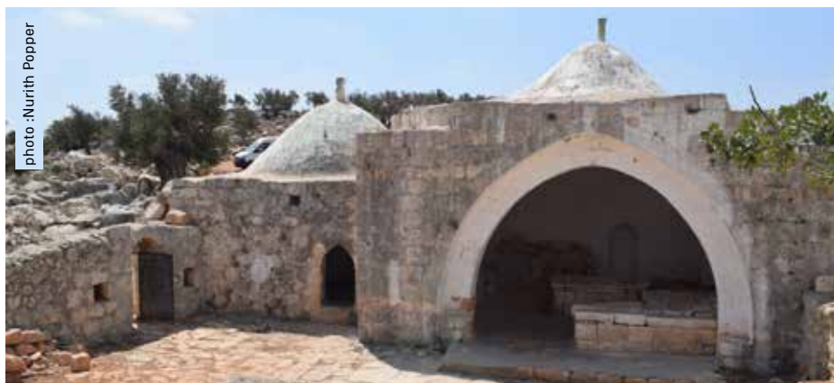
Maqam Majdoub – grave headstones are seen in the larger space of the Maqam, 22.8.2018