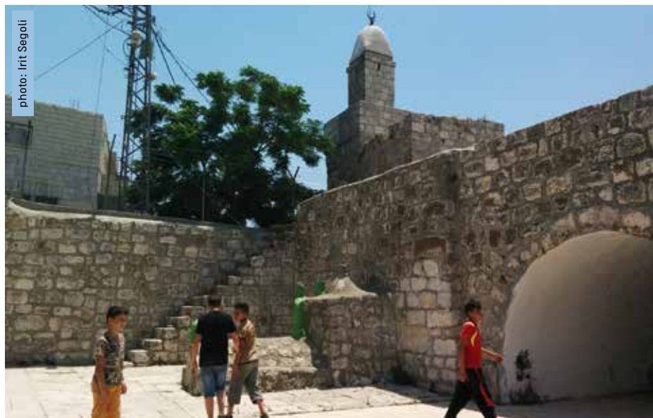
Maqam E-Nnabi Mata, 5.7.2017

This Maqam is situated in the heart of the Palestinian town of Beit Umar, not far from its central mosque. It was built in honor of Mata, father of the Prophet Jonah, during the Mamluk period (1291-1516) above the foundation of an earlier Byzantine building, and its square-shaped tower characterizes the Mamluk style of construction around Hebron and Jerusalem.