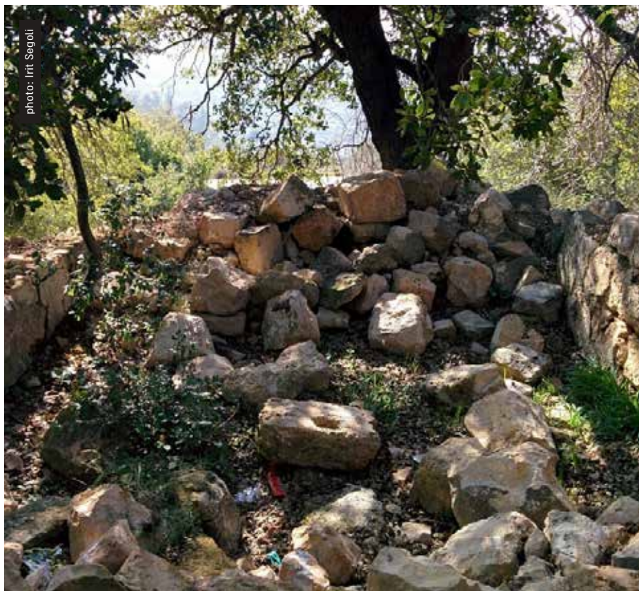
Ruins of Maqam Sheikh 'Issa, July 28, 2017

This Maqam is situated in an archeological site named Winery Hill. Access to it is through the settler-colony of Talmon. For Palestinians it is out of bounds. The site has ancient trees, wine presses and many archeological findings. Explanatory signs at the site date the findings to the Talmudic period.