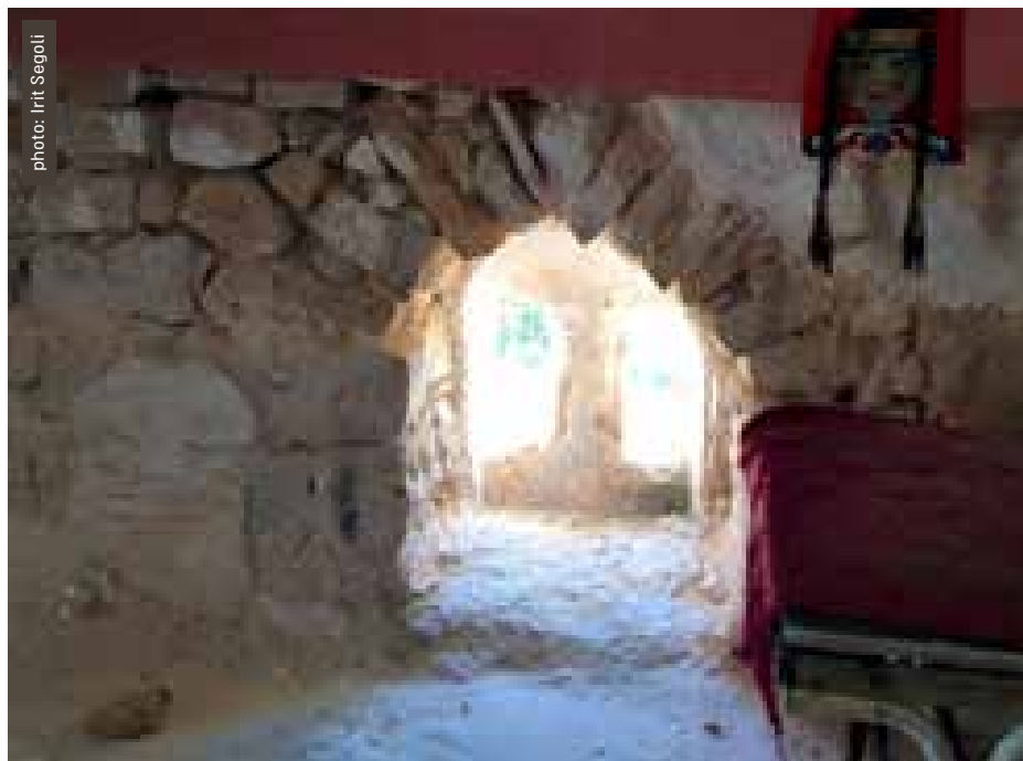
Interior of the Maqam, top floor, April 20, 2016

Visiting there three months later, we found a mattress inside the top floor of the Maqam, among stones that had fallen out of its walls.