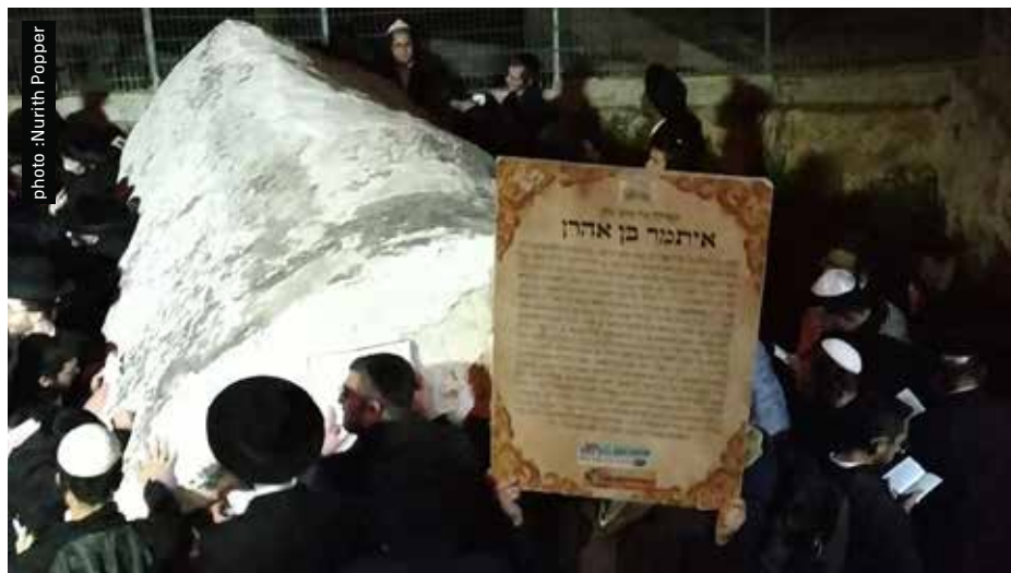
Tomb of Itamar, Son of Aharon the Priest, 3.4.2019

In the village center, next to a taxi station, lies Itamar's Tomb. The nearby Jewish settler-colony of Itamar is named after him. The village is totally darkened, and the graveside with the sign next to it completely ignore the fact that the villagers are hiding in their homes.