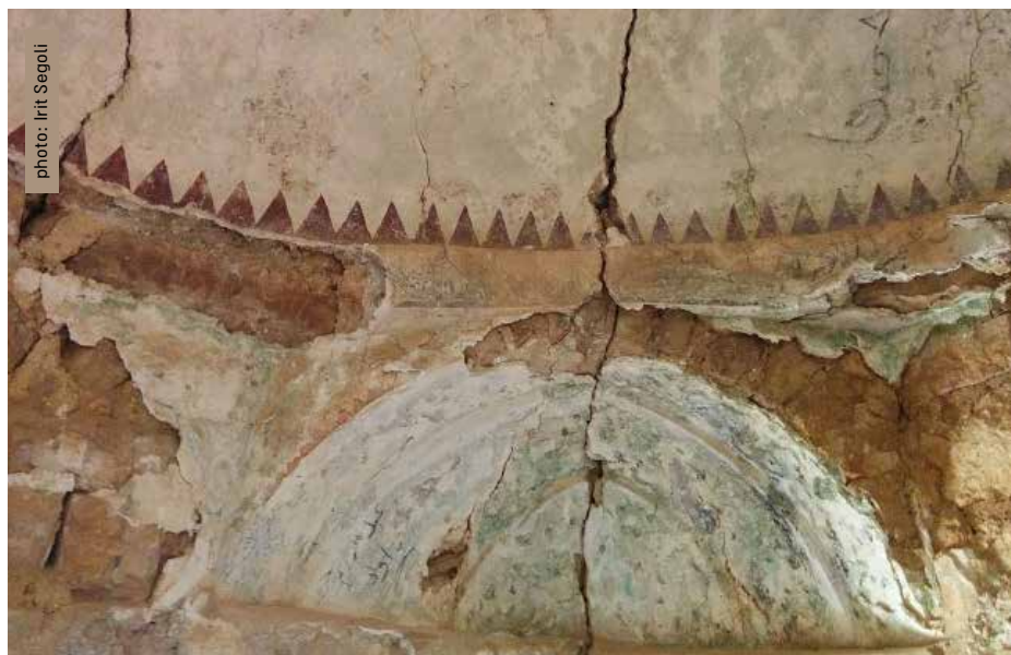
Ceiling and decorated walls of the inside space of Maqam Umm A-Sheikh, May 17, 2017