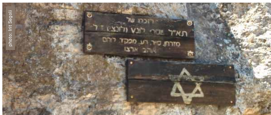
Luntz observation point, September 27, 2017

There is no sign indicating the name of the Maqam or the relation of Sheikh Bilal Ibn Rabah to the Prophet Mohammad. Signs at the site do lead to the Luntz Observation Point, located some 100-meters north-east of the Maqam itself. Unlike the neglected Muslim Maqam, the commemoration site of the Israeli governor of Nablus, Joseph Luntz, is beautifully tended. Under a giant oak tree overlooking the Tirtza river bed, a sign says: "The late Brigadier-general Joseph Luntz (Luntzi): orientalist, hiker, friend, commander, fighter, patriot". A visit here is a lesson in the Israeli rulers' disregard of Palestinian cultural and religious heritage, and the aggrandization of the occupation heritage and figure of the military governor. Responsibility for Palestinian heritage sites lies entirely with the State of Israel, which holds them under its military occupation.