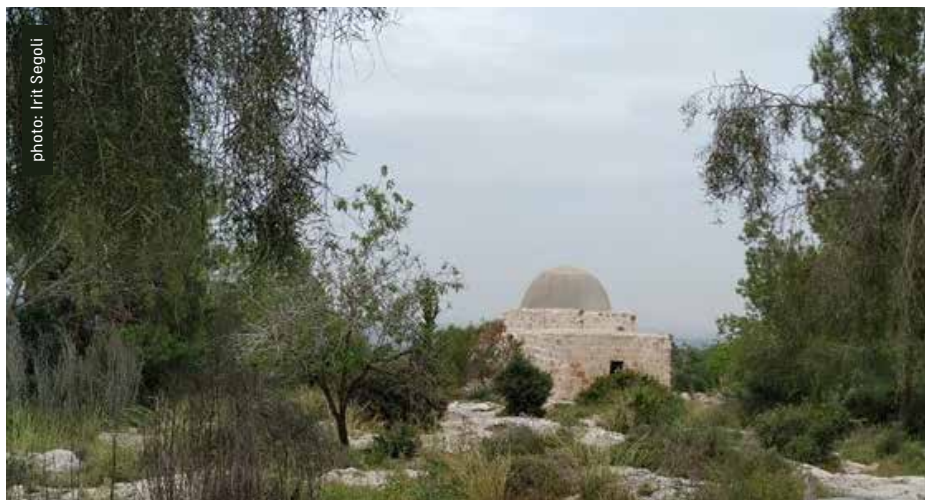
Maqam Ibn Jabal in Park Ayalon-Canada

Until 1967 this Maqam was the site of prayer and gatherings of the surrounding villagers from Yalu, Beit Nouba, 'Imwas and Bir Ayoub. People came there from other villages in the area as well, such as Beit Leekiya and Beit Sira. Following the 1967 occupation, the villagers were expelled and the villages destroyed.