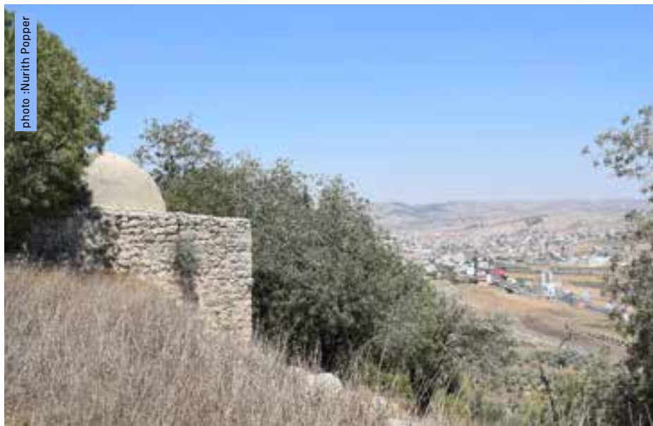
Maqam Sheikh Abu Ismaeel (called Nabi Ismaeel on Israeli maps)

The Maqam itself is a domed, square building with an inner space that is broad and about 5-meters high. Its walls are solid, thick and strong. Remains of decorative motifs are visible on the walls despite the neglect. Jewish nationalist graffiti appear on the walls both inside the Maqam and on its exterior.