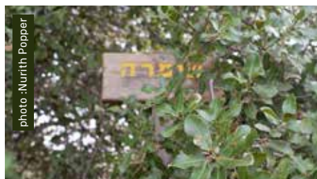
The old sign, "Guard shed", hidden among the oak branches, 7.2.2018

Now only one shed remains, exhibited in the archeological site as a guard-shed of the Second Temple Period.