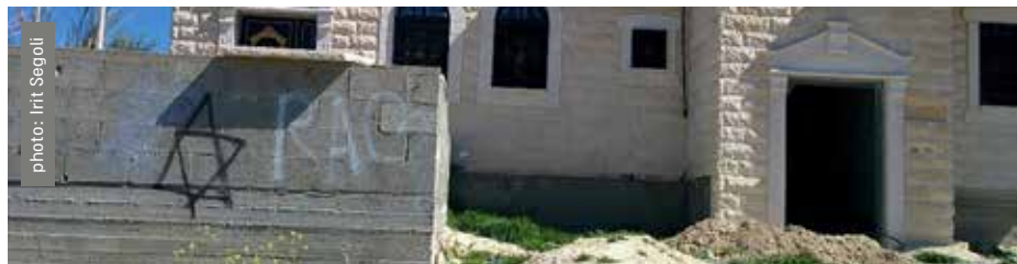
A Star of David painted there on the night the rabbi was buried, March 7, 2018

After the rabbi of Havat Gil'ad was murdered on January 9, 2018 near the settler-colony of Yitzhar, dozens of settler-colonists from Havat Gil'ad invaded Far'ata, broke windows panes, used clubs to hit doors and wrought general havoc in the village. Following this traumatic experience, a certain boy living near the Maqam has been stuttering ever since. No treatments have helped.