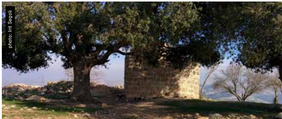
The Maqam on Mount Truja, 2017

This Maqam lies at the top of Mount Truja, inside the Sheikh Zayid nature reserve, approved as part of the Judea and Samaria area. It covers ams. There are ancient oak trees next to the Maqam.