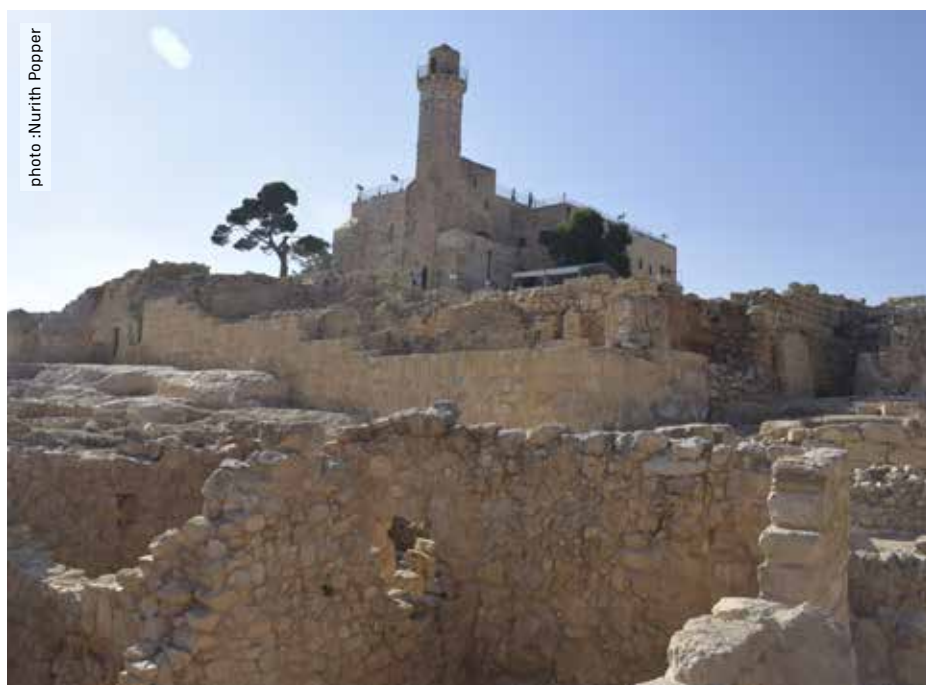
The demolished village Nabi Samauil at the foot of Nabi Samauil mosque, tomb of the Prophet Samuel 24.5.2018