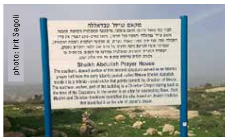
A sign directing visitors to Maqam Sheikh Abdallah, February 7, 2018