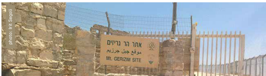
Entry to the archeological site containing Maqam Sheikh Ghanem, July 27, 2016