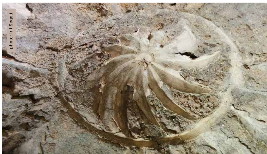
The ceiling of one of the rooms adjacent to Maqam Umm A-Sheikh shows a relief of Crusader tradition, May 17, 2017

Maqam Umm A-Sheikh is surrounded by a courtyard and structures. This important heritage site has been neglected and dilapidated inside the area declared closed army maneuver zone.