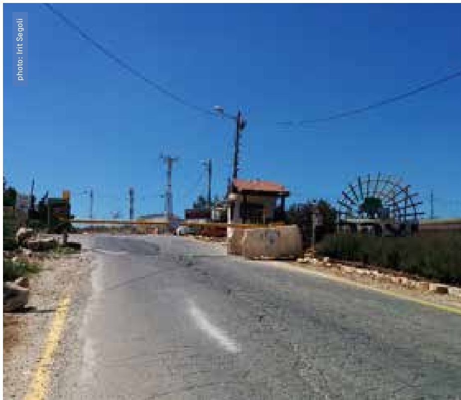
Entry gate to Yitzhar settler colony, August 2, 2017

Entry of the Yitzhar settler-colony gate is forbidden for Palestinians as well as Palestinian citizens of Israel. It is open only to Jewish Israelis and holders of foreign passports. When we arrived at the gate on August 2, 2017 with a Muslim Israeli driver from Kafr Qassem, the guard refused to let him enter the settler-colony.