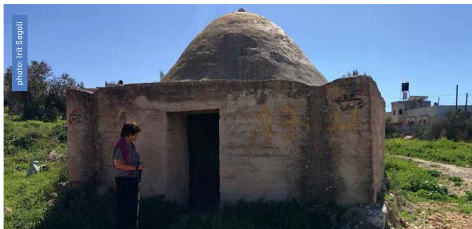
Maqam Abu Joud in Far'ata, March 7, 2018

Maqam Abu Joud is named after a local dignitary and located on the outskirts of the Palestinian village of Far'ata. Settler-colonist outpost Havat Gil'ad was built to the north. Settler-colonists from the outpost invade and carry out demonstrative incursions at the Maqam, claiming this is the tomb of Judge Abdoun son of Hillel of Far'atun, buried in Far'atun (Judges 12: 15).