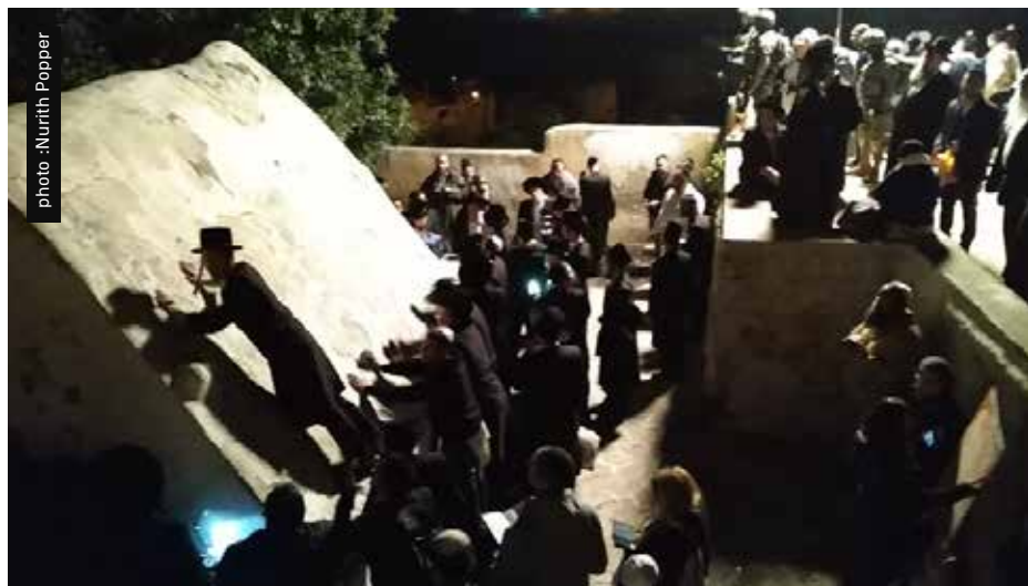
Tomb of Elazar the Priest, 3.4.2019

The large compound of Elazar's Tomb lies on a hill west of the village. The sanctified oak tree next to the grave appears in all the old photographs. Jewish celebrants pull off its branches. From various talks we learned that the person tearing the branch off would have as many offspring as the number of leaves on that branch. Muslim tradition stipulates that damage to the holy tree next to the Maqam is forbidden and is considered vandalism of the tomb itself.