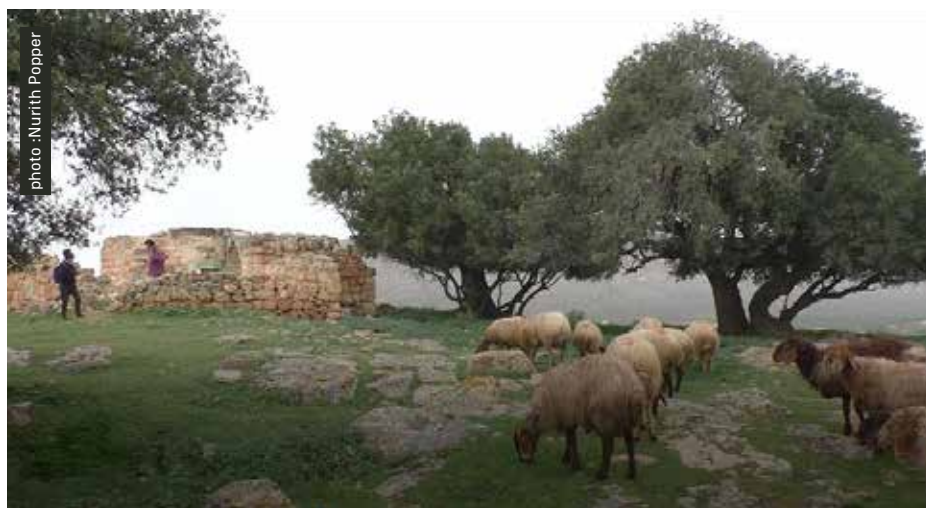
Maqam E-Nnabi Noun, 1.3.2017

A Palestinian shepherd from Yanoun village whom we met near Maqam E-Nnabi Noun told us that settler-colonists from the outpost of Giv'at Arnon come from their outpost to the Maqam area on a daily basis, threatening and frightening him.