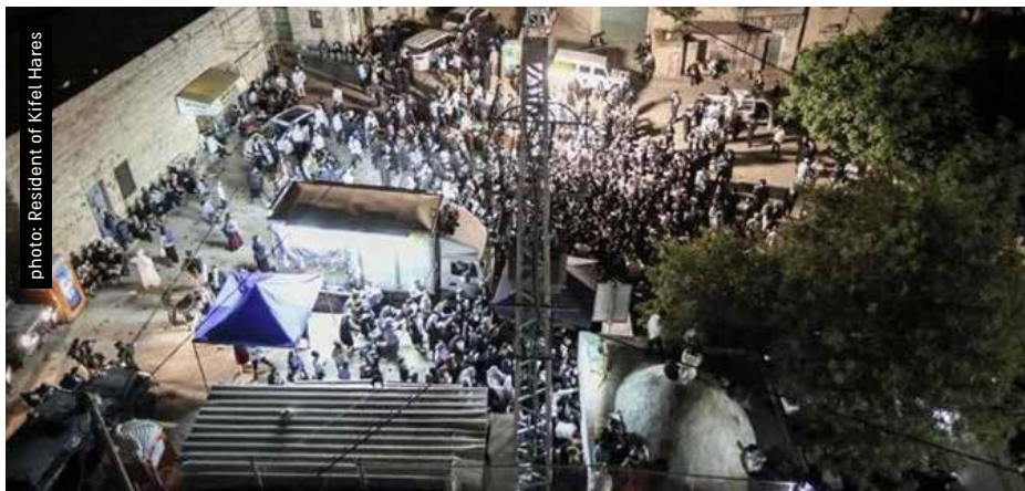
The open area near Caleb's Tomb, 4.5.2016