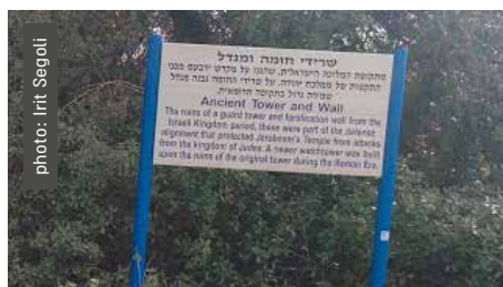
A new sign says "Remains of the early Zionist settlement period", 7.2.2018

The old sign, "Produce shed" has been discarded and replaced by the more recent sign