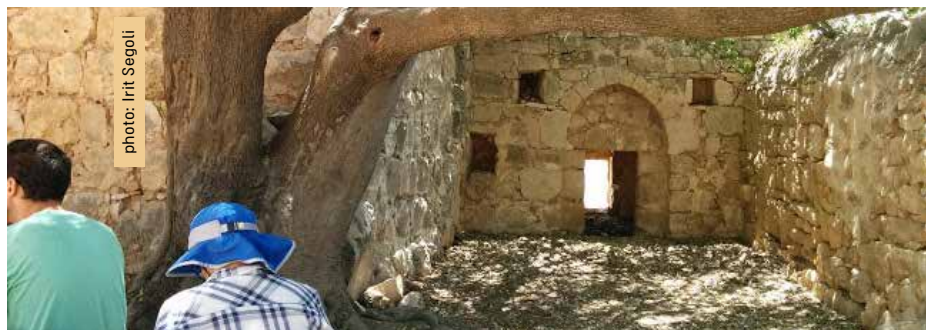
The courtyard at Umm A-Sheikh, under an ancient oak tree, May 17, 2017