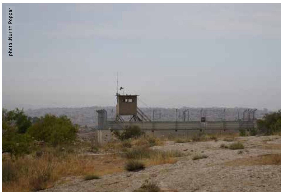
Israeli army post on the E-Nnabi Yaqeen hill, 21.6.2017