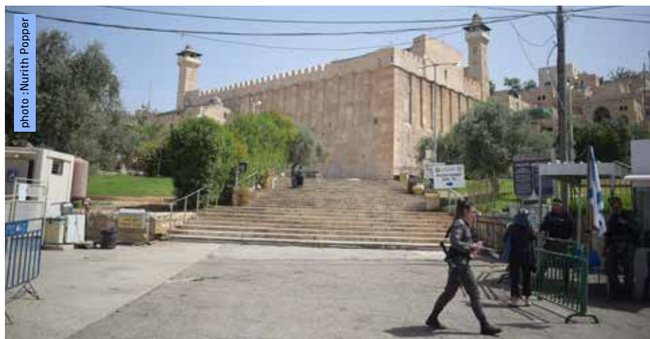
The main entrance to the Cave of the Fathers – for Jews only, 3.7.2018