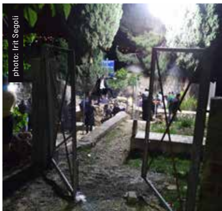
Cemetery adjacent to Caleb's Tomb, 30.4.2019