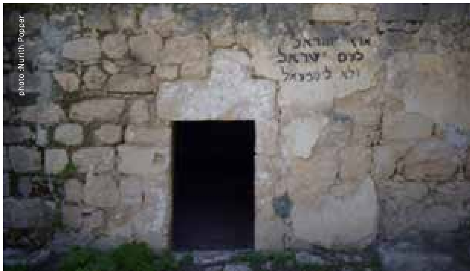
The façade of Maqam Abu Ismaeel is smeared with the slogan "The Land of Israel belongs to the People of Israel, not to Ismaeel", July 27, 2016