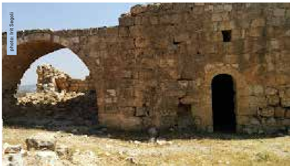
Maqam Sheikh Zaitoun, May 17, 2017

A scene out of a video: the photographer's son points to the Muslim prayer niche, saying " this is the animal corner " and disparagingly demonstrates the Muslim prayer posture.