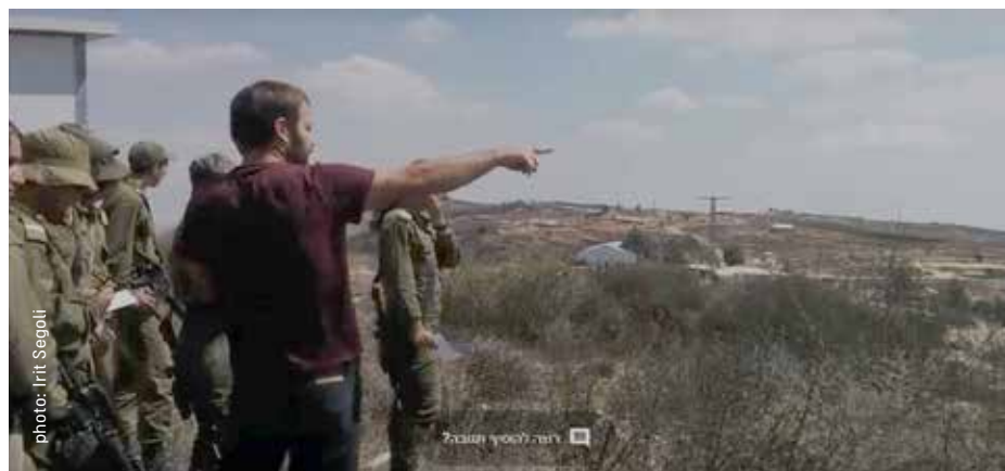
The security official of Itamar settler-colony briefing Israeli soldiers at the top of Mount Mohammad, September 27, 2017

(Aviv Lavie, Terror of the Hills , Haaretz daily newspaper, August 21, 2011)