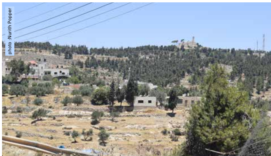
Nabi Samauil as seen from Nabi Laimoun which has been renamed Alonei Shmuel nature reserve, 7.6.2017

There is no way to access Nabi Samauil from Nabi Laimoun. 21