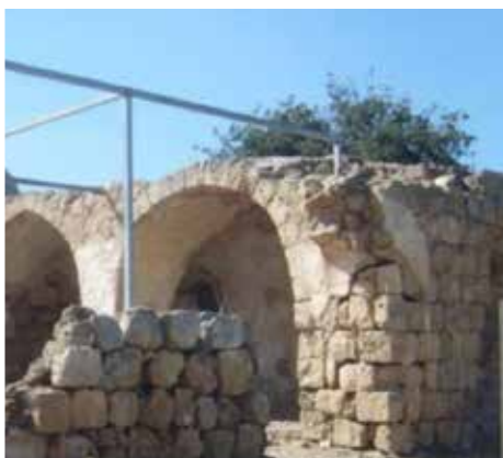
Maqam Sheikh Bilal, February 28, 2018