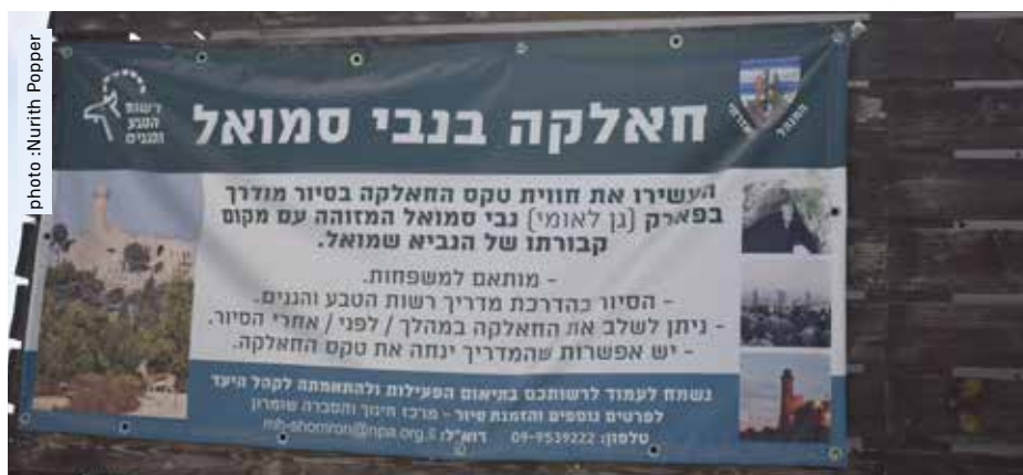
Invitation to the Prophet Samuel's Celebration at Nabi Samauil, 24.5.2018

The mosque does separate Palestinians from Jews at prayer times, but in actual fact, all the fences, checkpoints, roads and settler-colonies closing in on it from all sides enable very few Palestinians to reach it. Jews, on the other hand, swarm to the site by organized transports and buses from all over the country. There are mass visits at the site arranged by the Civil Administration and the Israel Nature and Parks Authority.