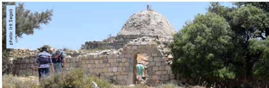
Maqam Umm A-Sheikh, May 17, 2017

The Palestinian landowners are allowed to access their fields only a few days a year. To this end they must be issued a license and cross the "agricultural checkpoints" – one located inside the settler-colony and the other – in the fence of Israeli army's Ofer Camp. Until the Israeli occupation and the construction of settler-colony Beit Horon, Palestinians from the villages of Beit Ghor Al-Foqa, Beit Ghor A-Tahta, Beitunia and others would visit the site on their pilgrimages.