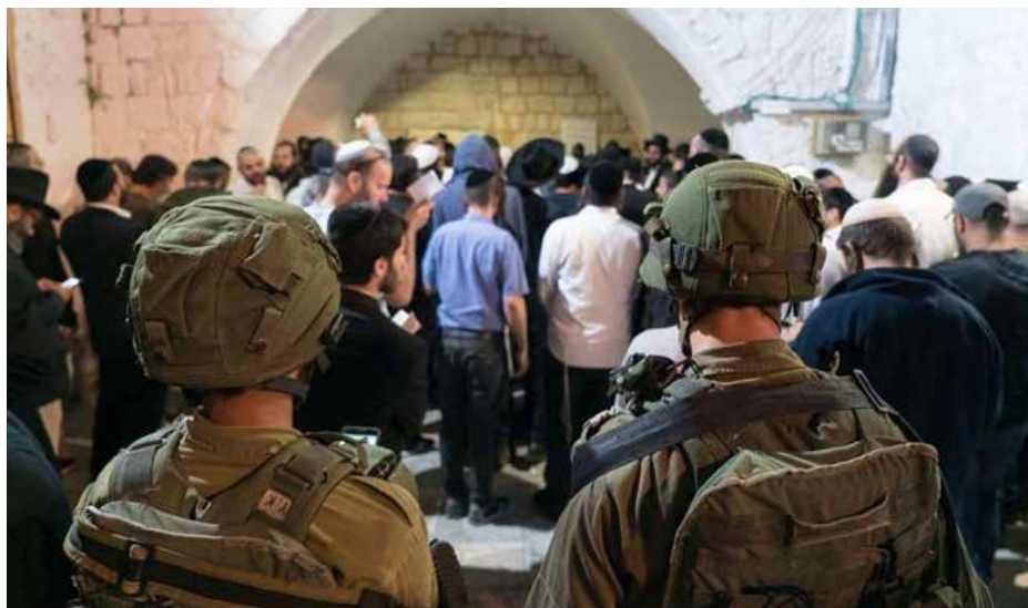
Mass pilgrimage to Joseph's Tomb

Joseph's Tomb is located inside the Palestinian city of Nablus, near Balata refugee camp. According to the Oslo Accords of 1995, the burial compound and road leading to it are an enclave under Israeli military control within Area A, which is supposedly subject to full Palestinian control. The southern wall of the Maqam contains the mahrab. The Qur'an dedicates an entire chapter to Joseph, Jacob's favorite son. Mohammad identified with Joseph and found similarities in his own biography and that of Joseph – both were ridiculed in their youth. Only as adults did they rise to grandeur and won the admiration of their own people. In order for Jews to access Joseph's Tomb, the State of Israel ruled that it would fully control even the road leading to the site. Thus, Muslims are excluded from their own sacred site. Jewish mass pilgrimages are a focus of friction and restrict Palestinian freedom of movement. The Joseph's Tomb Administration organizes such visits and publicizes the dates of pilgrimages to holy men's graves at 'Awarta and Kifl Harith (both Palestinian villages) as well. Israeli government ministers and members of Knesset (Israel's parliament) take part in pilgrimages to Joseph's Tomb.