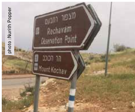
A sign indicating a nature reserve refers to Rehav'am Ze'evi, to whose memory both reserve and balcony are dedicated, 7.2.2018