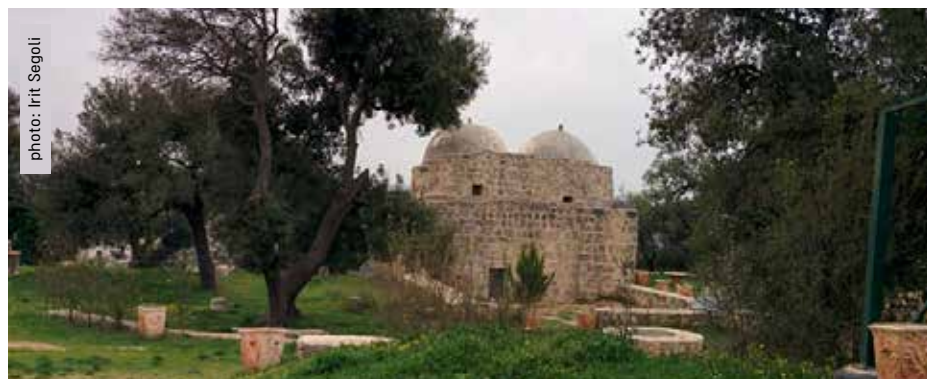
Maqam Sheikh Qatarwani, 22.3.2017

Maqam Sheikh Qatarwani is a double-domed structure, adjacent to the Palestinian village of 'Atarah. Although the site is designated as a nature reserve called Alonei Atarah, the villagers have managed to save it from Israeli takeover, restore it, and surround it with a fence, as well as turn it into a community site for weddings and recreation of entire families.