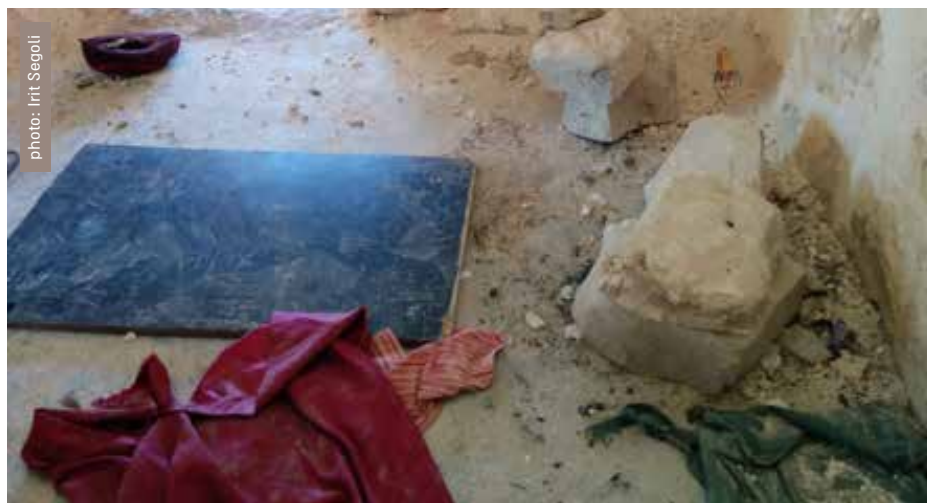
Central space of the second floor, July 13, 2016

Visiting there three months later, we found a mattress inside the top floor of the Maqam, among stones that had fallen out of its walls.