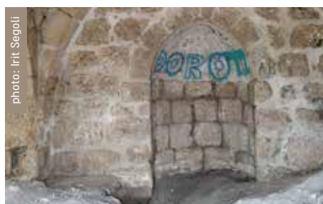
The interior of the Maqam, KKL-Jewish National Fund in charge, April 15, 2019

Villages destroyed in 1967 are not mentioned throughout the Ayalon-Canada Park. An example of this is the sign placed next to Maqam Ibn Jabal in the photo above. The State of Israel has erased them in their entirety and wishes to erase them from memory as well. However, the refugees have not forgotten and hope to return and rebuild their homes there.