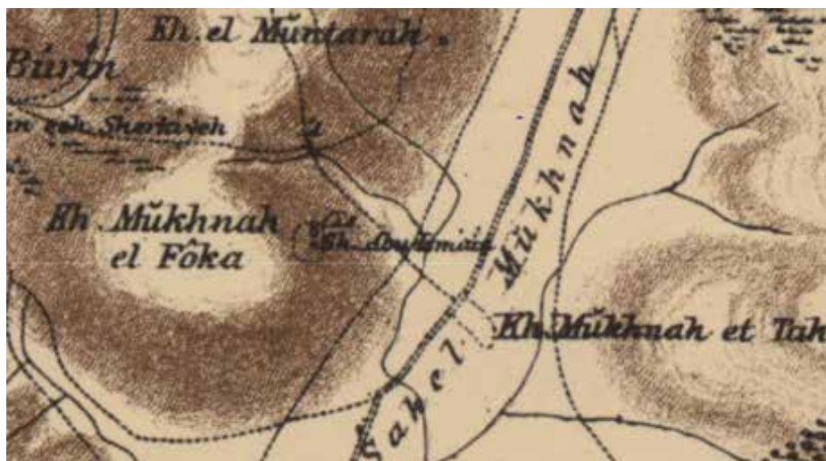
A British survey map of 1880, showing Maqam Sheikh Abu Ismaeel

This Maqam was built in honor of Abraham, father of Isaac and Ishmael. It is located on Mount Abu Ismaeel, nowadays inside the Nabi Ismaeel nature reserve, part of the Judea and Samaria occupied territory. It covers about 25 dunams. The name of both the Maqam and the mountain is Abu Ismaeel, and appears on the British survey map of 1880. This is also the name Palestinian villagers use. In spite of this fact, on Israeli maps the site is called Nabi Ismaeel – indicating the son of Abraham rather than Abraham himself. The question is when and by whom the name was changed from Abu Ismaeel to Nabi Ismaeel – from Abraham, revered by all three monotheistic faiths, to his son's – Ismaeel, Ishmael.