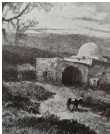
Rachel's Tomb after its restoration and the added room at the initiative of Montefiore in 1841 18

In 1841, at the behest of the Turkish rule, Moshe Montefiore – a Jewish-English philanthropist – restored the tomb and added a lobby. This is where a mahrab was installed. "Eventually, Muslims sometimes purified their deceased there". 17