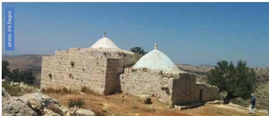
Maqam Majdoub (appearing on the Israel Trails map as Rijel Su'afa), 5.9.2018

The Maqam is situated in an un-administered part of the Upper Shilo nature reserve, in between two large settler-colonies: Peduel and Beit Arye. The reserve is approved as part of the Judea and Samaria area. It lies over 12,713 dunams. The Maqam itself is restored and active. A villager of nearby Deir Ghassana told us that in the past the villagers came from Deir Ghassana, Jaljuliya, Kafr Qassem and Sanariya, and are the ones to have initiated the restoration of the Maqam, taking part in it themselves as well.