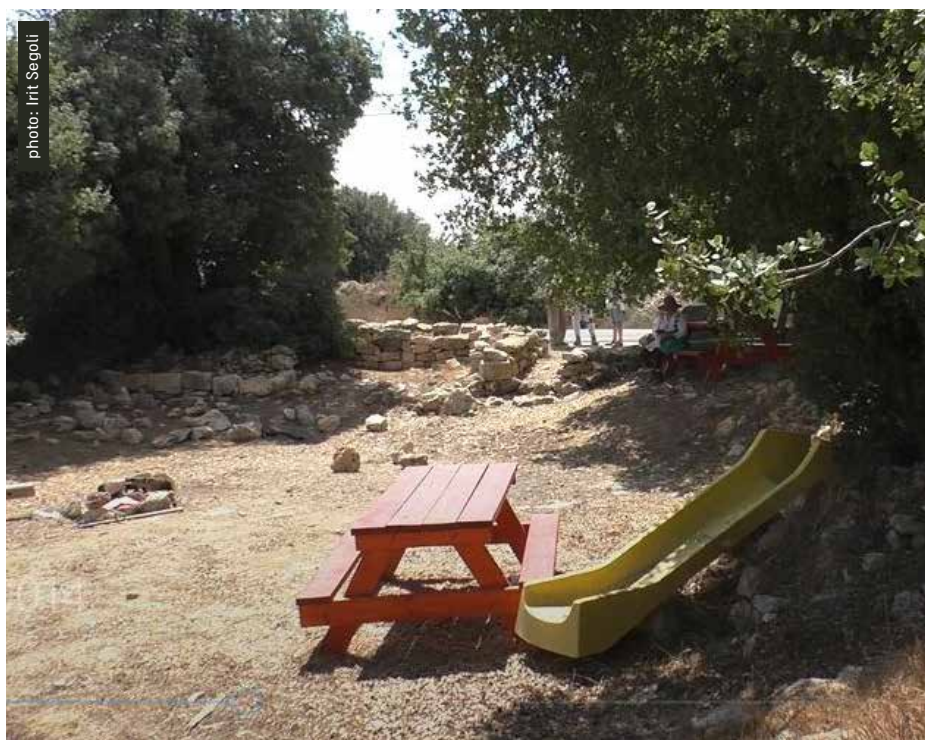
The site still shows the steps and floor of the Maqam yard

Maqam E-Nnabi Danial was built by Muslims on land belonging to Al Khader villagers, close to Bethlehem. One day it simply disappeared, and in its stead settler-colonists of Neve Daniel and its outpost Sdeh Boaz arranged picnic tables. At the site, an entrance area and steps to the Maqam yard have remained, on a soil-covered floor. According to Al Khader resident as well as a villager of nearby Khirbet Bet Zakariya, villagers of the vicinity used to come there to pray and celebrate. They say the Maqam was demolished 15 years ago, about one year after the outpost of Sdeh Boaz was founded nearly 16 years ago