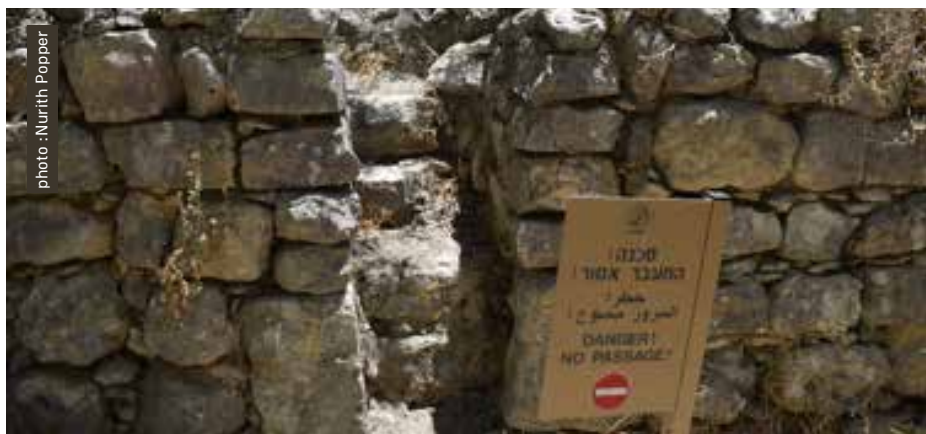
At the entrance to the Maqam roof, a sign placed by the Israel Nature and Parks Authority, warns in three languages: "Danger! Passage forbidden!" July 27, 2016

The site grows ancient Atlantic Terebinth trees. Below Abu Ismaeel Mountain runs a large water source named 'En Mahna, whose water irrigated Boureen's fertile lands in the past. Nowadays the spring is divided into a Jewish ritual basin for men of the surrounding settler-colonies and two small wading pools called Amasa, commemorating Amasa Meshulami who was killed in the Second Lebanon War.