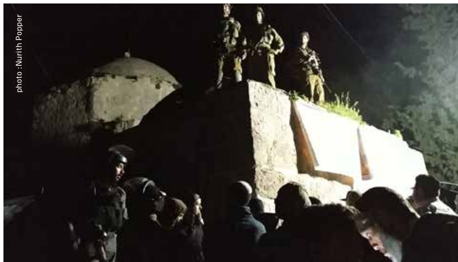
Pinhas' Tomb, 3.4.2019

This Maqam is adjacent to the local cemetery. During the Jewish celebrations, pastries were being served next to the tomb, and the Israeli army prevented the pilgrims from entering the cemetery. The compound was flooded with projector lights and observants crowded there and held loud celebrations.