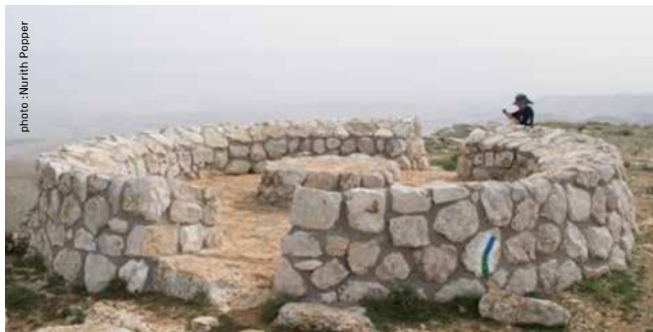
The round-shaped balcony at the top of Qubbet A-Najme

On October 3, 2018 during our visit at the Deir Jarir local council, we were told that bulldozers belonging either to the settler-colonists or to the Israeli army demolished the Maqam. The Israel Nature and Parks Authority is responsible for the site, and is thus obliged to look into the issue.