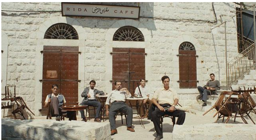
The Time That Remains, Elia Suleiman