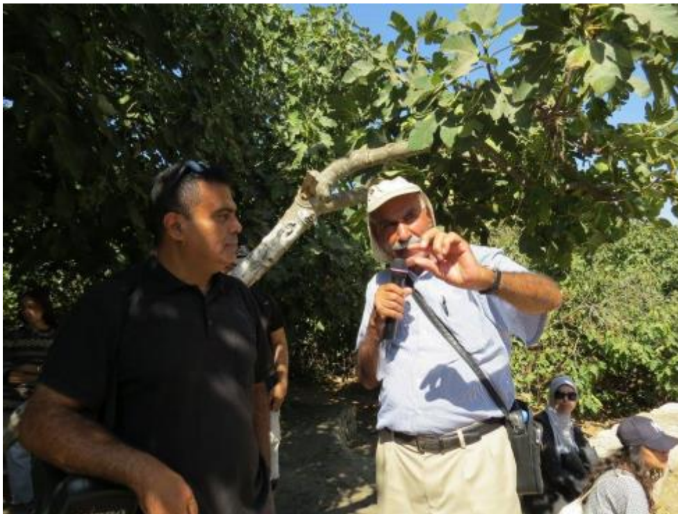
Testimony collected in the tour to Lifta

The creation of an oral archive on the crimes of the Nakba and the war in 1948 is one of Zochrot's core missions when facing the challenge of the predominant historical discourse in Israel. As time goes by, the majority of the survivors and Zionist fighters are already dead, or dying. Thus, Zochrot prioritizes this project in the next years. In 2016, we have collected 10 testimonies from Palestinian refugees and 3 testimonies from Zionist-Jewish fighters from 1948. In 2017, all testimonies will be transcribed, translated, edited into short clips and uploaded to Zochrot's website and online archive. We are expected to collect many more testimonies in 2017-2018.