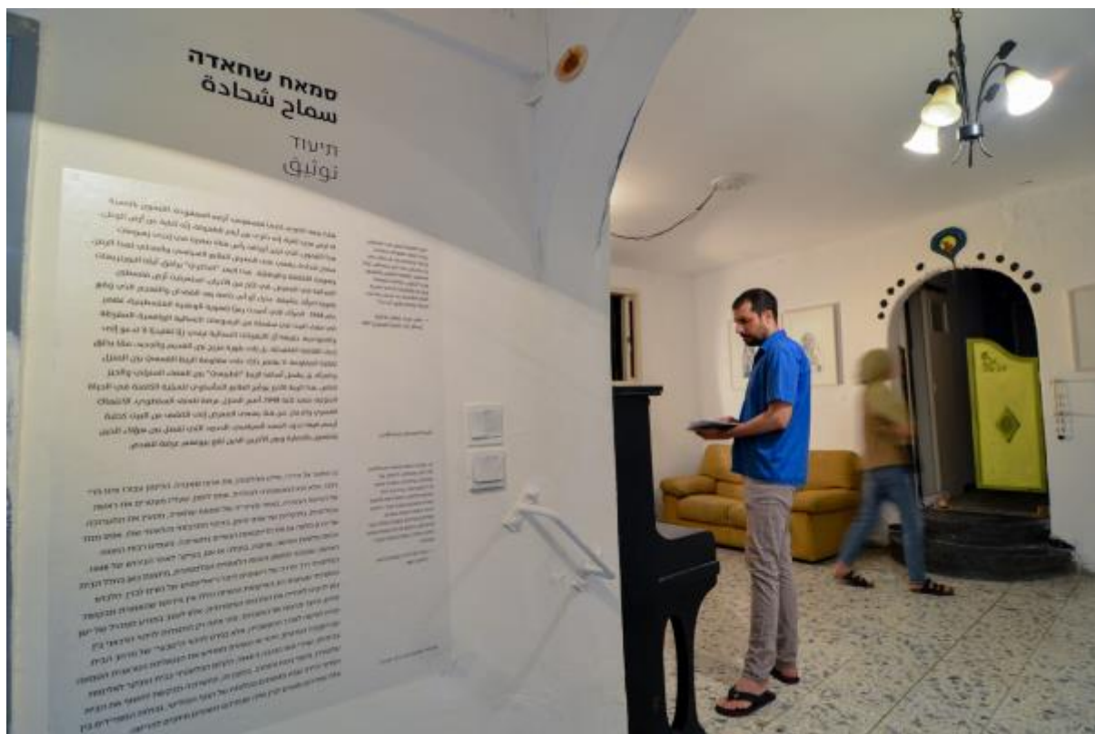
Houses Beyond the Hyphen