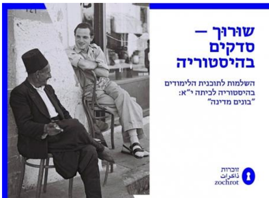
Shuruch – Cracks in History

Shuruch – Cracks in History: A teaching kit designed to fill significant gaps in the official education program by providing complementary information and insights to students of Unit 4 in the official curriculum for the 11th grade: “Building the State of Israel in the Middle East”. The program is designed to expand on the standard lesson plans and offer alternative approaches to key themes in the official curriculum. In each of the topics selected, we have provided historical information excluded from the curriculum as well as raised critical questions regarding past and present.