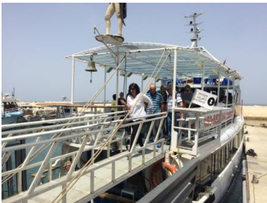
Return flotilla at the Nakba day

Nakba Commemoration event at the Israeli Independence Day: On the eve of Israeli Independence Day Zochrot held a lecture "Between Imagination and Expectation" dealing with the Palestinian Refugees in Southern Lebanon. The lecture was held by scholar Tiina Järvi (University of Tampere, Finland) and was followed by an open discussion with the audience. Around 40 people participated.