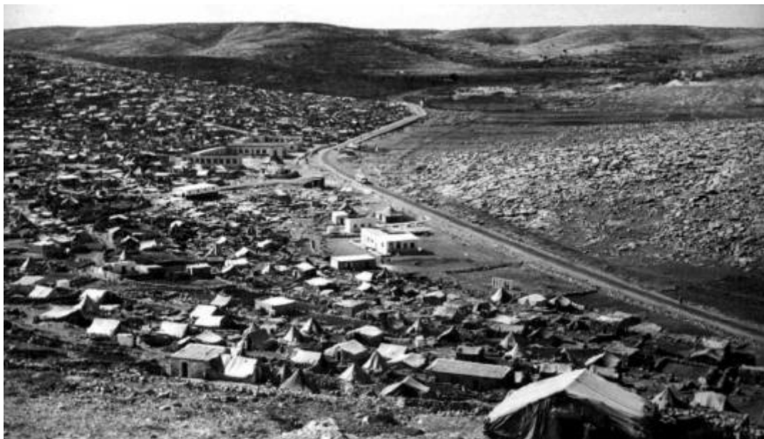
Online Nakba Archive

Zochrot's website serves as the largest and most accessible online Hebrew source devoted to the Nakba. The well-trafficked site has proven a very beneficial tool for reaching new audiences, including those interested in learning but reluctant to join our activities or visit our library. The website also contains a large visuals collection depicting Palestinian life before 1948 and during the Nakba. 98,317 unique users visited the website in 2016.