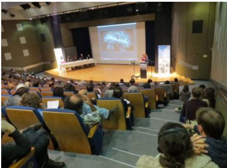
The Third International Return Conference