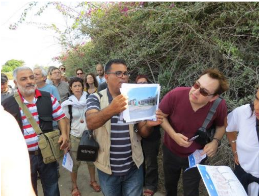
Tour to Tantara