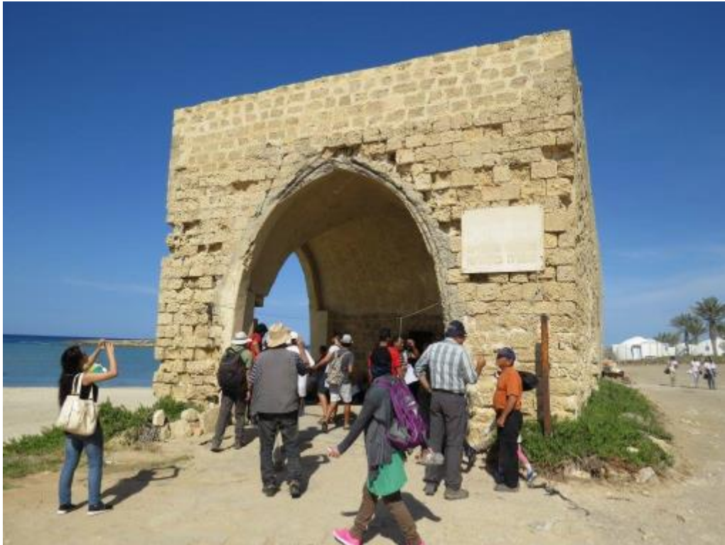
Tour to Tantara