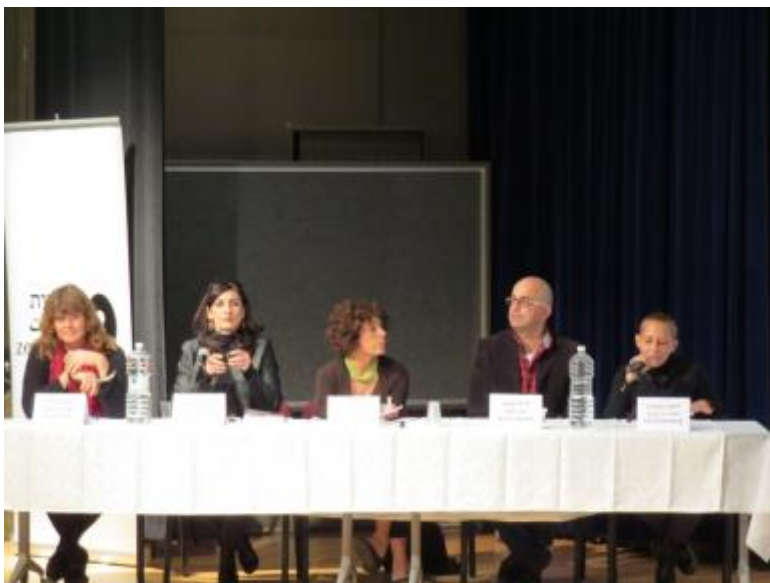
The Third International Return Conference