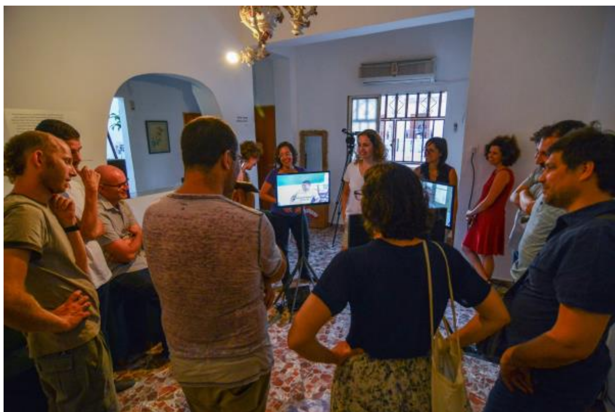
Houses Beyond the Hyphen