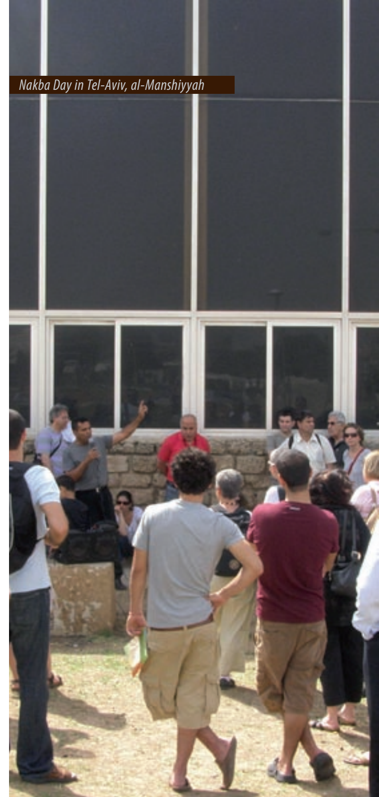
Nakba Day in Tel-Aviv, al-Manshiyyah

An additional event commemorating Nakba Day in Tel Aviv was held by activists of Israeli-Palestinian organization Sadaka-Reut. They used the big posters of refugees from Ras al-Ahmar, photographed two years ago in Lebanon as part of the "Bridging Memory" project. The posters were placed along Jerusalem Blvd. in Jaffa as part of an information tent on the Nakba that Sadaka-Reut erected for the benefit of the passers-by.