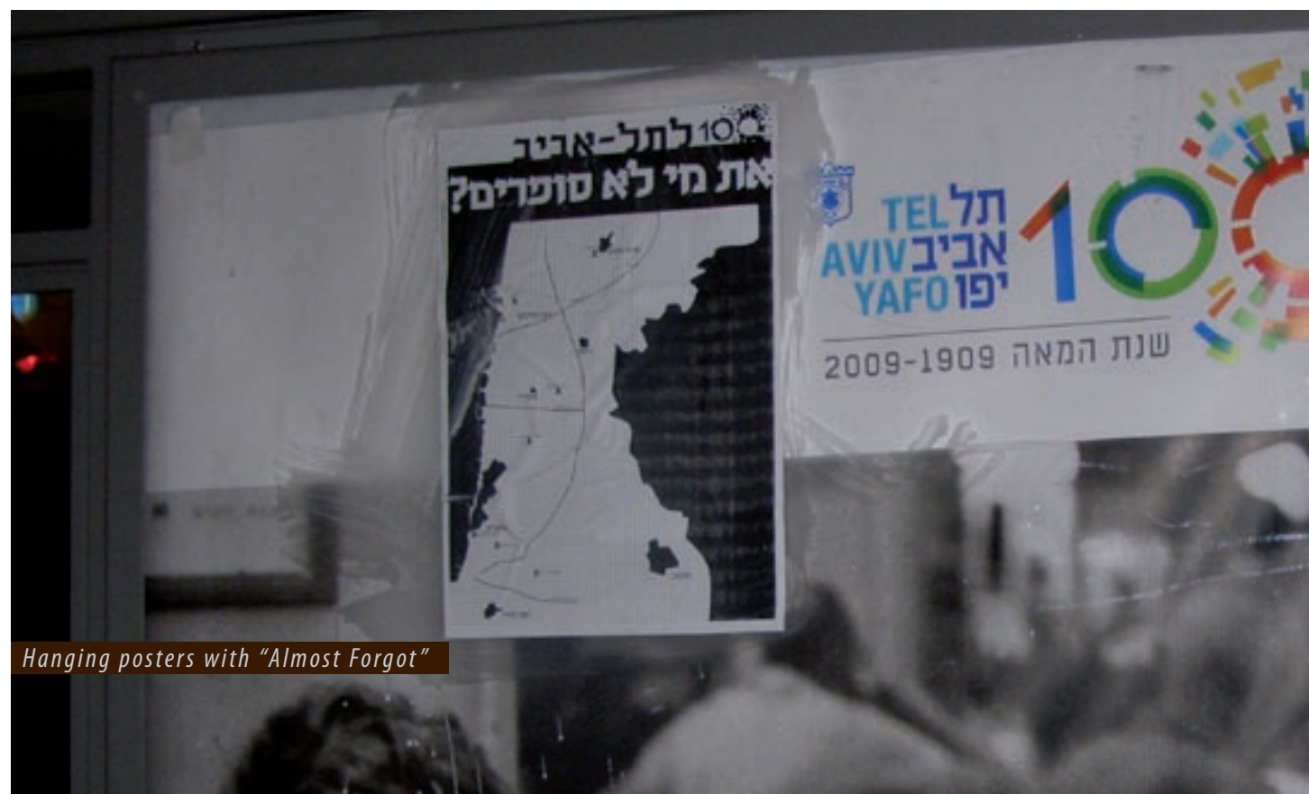
Hangin posters with "Almost Forgot"

Another ad-hoc activity took place following the massacre in Gaza, when Zochrot through Sedek joined the initiative Latset! ("Out Now!"). For further details on this initiative see below, under Sedek.