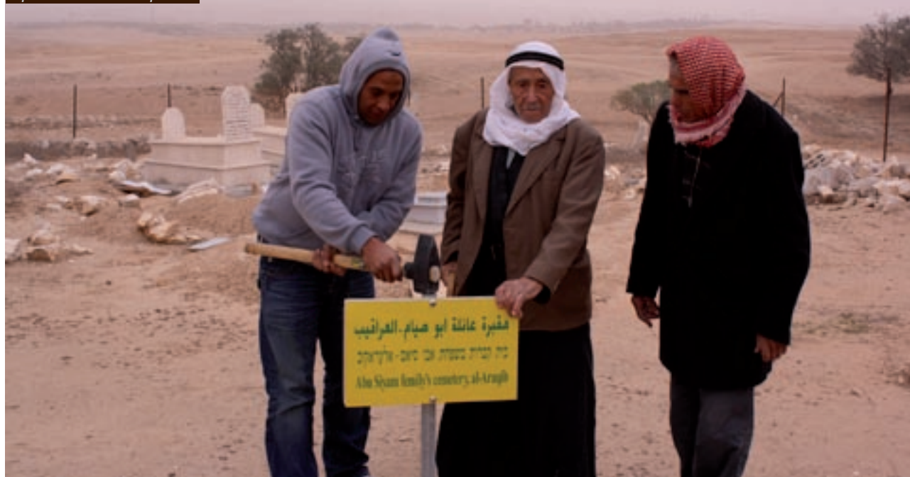
Open tour of al-Araqib