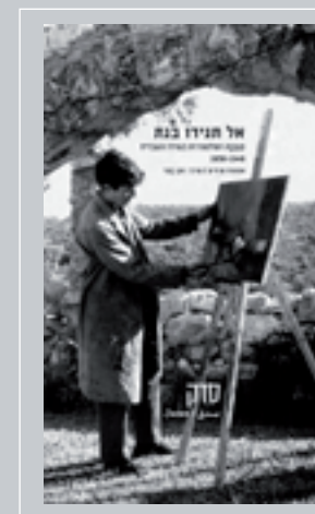
Above / Double spread, Sedek, 4th Issue. July 2009 // Up right / "La-tzet!" cover // Middle right / Sedek #4 cover // Bottom right / "Tell It Not In Gath" cover