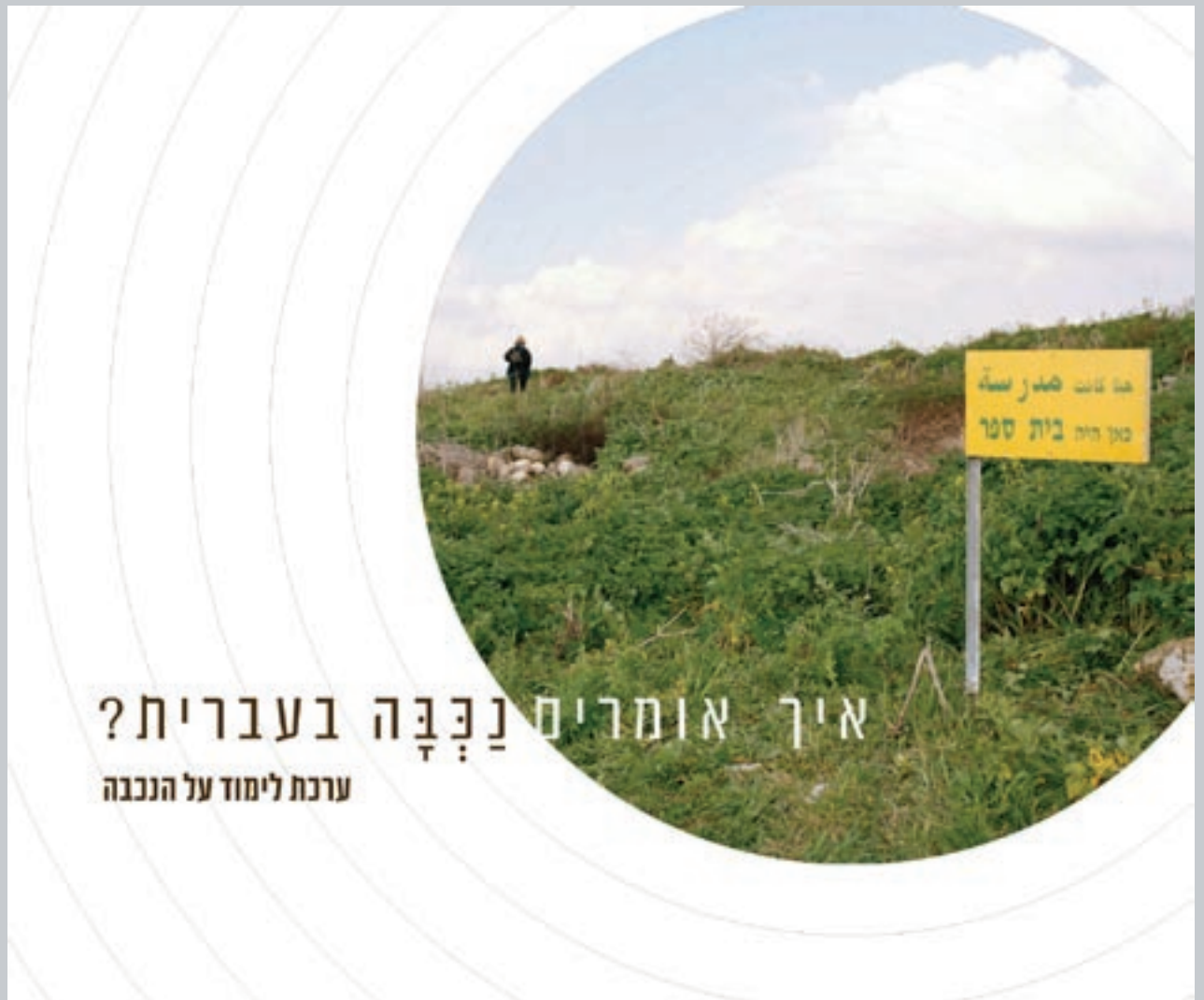
Launching event for Zochrot's new Study Guide (On the right, cover of the study guide)