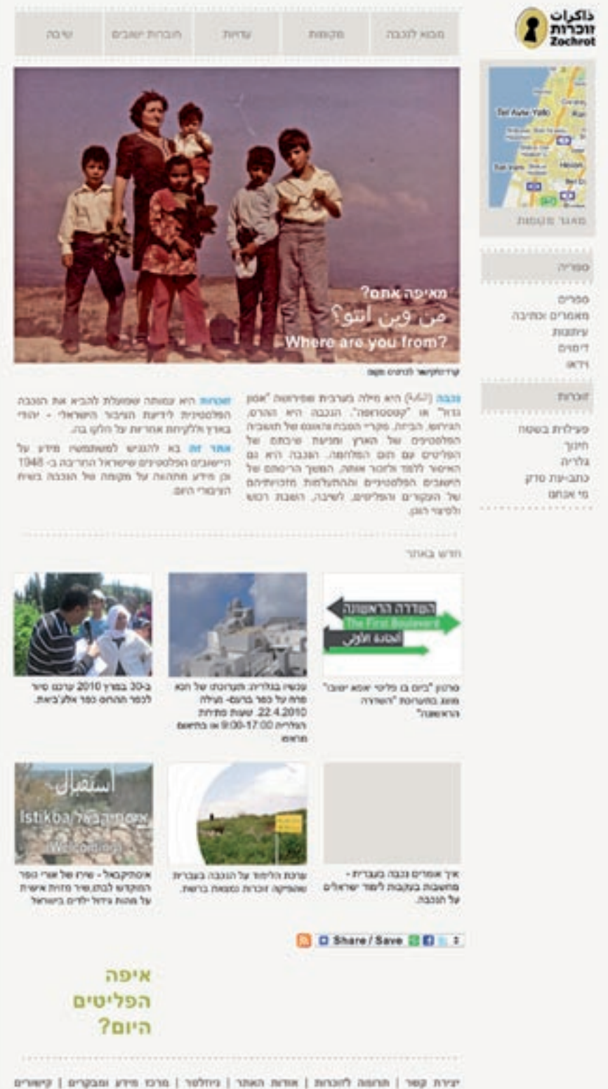
Sketch for the Homepage of the new website