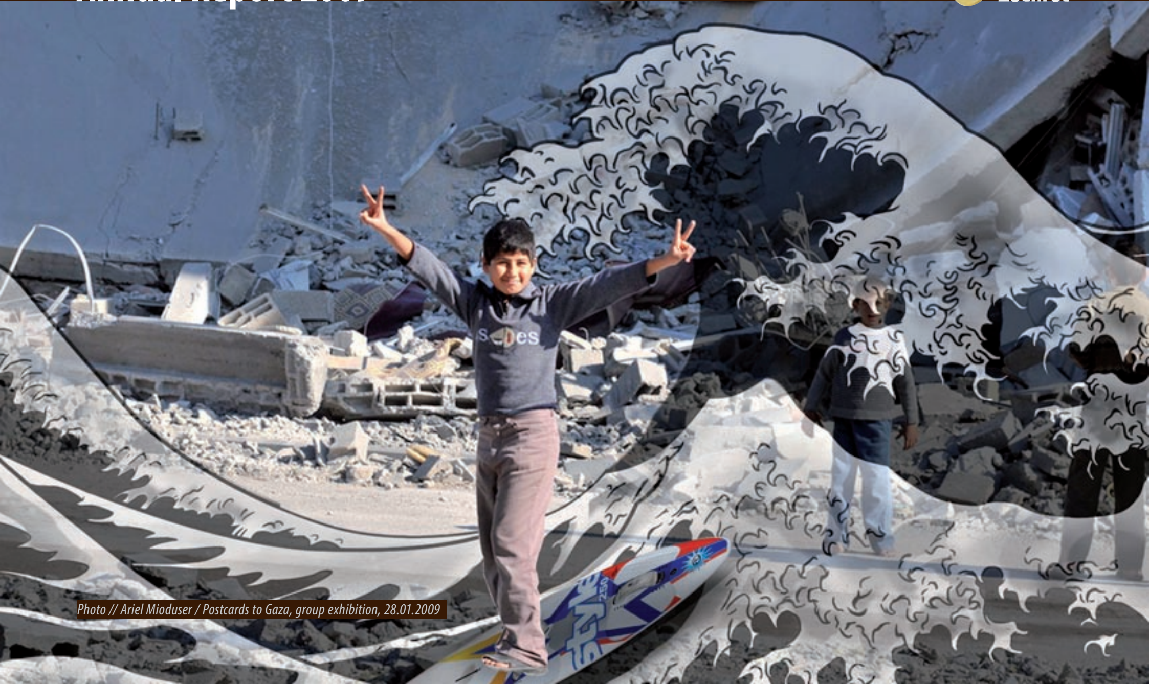
Postcards to Gaza, group exhibition, 28.01.2009