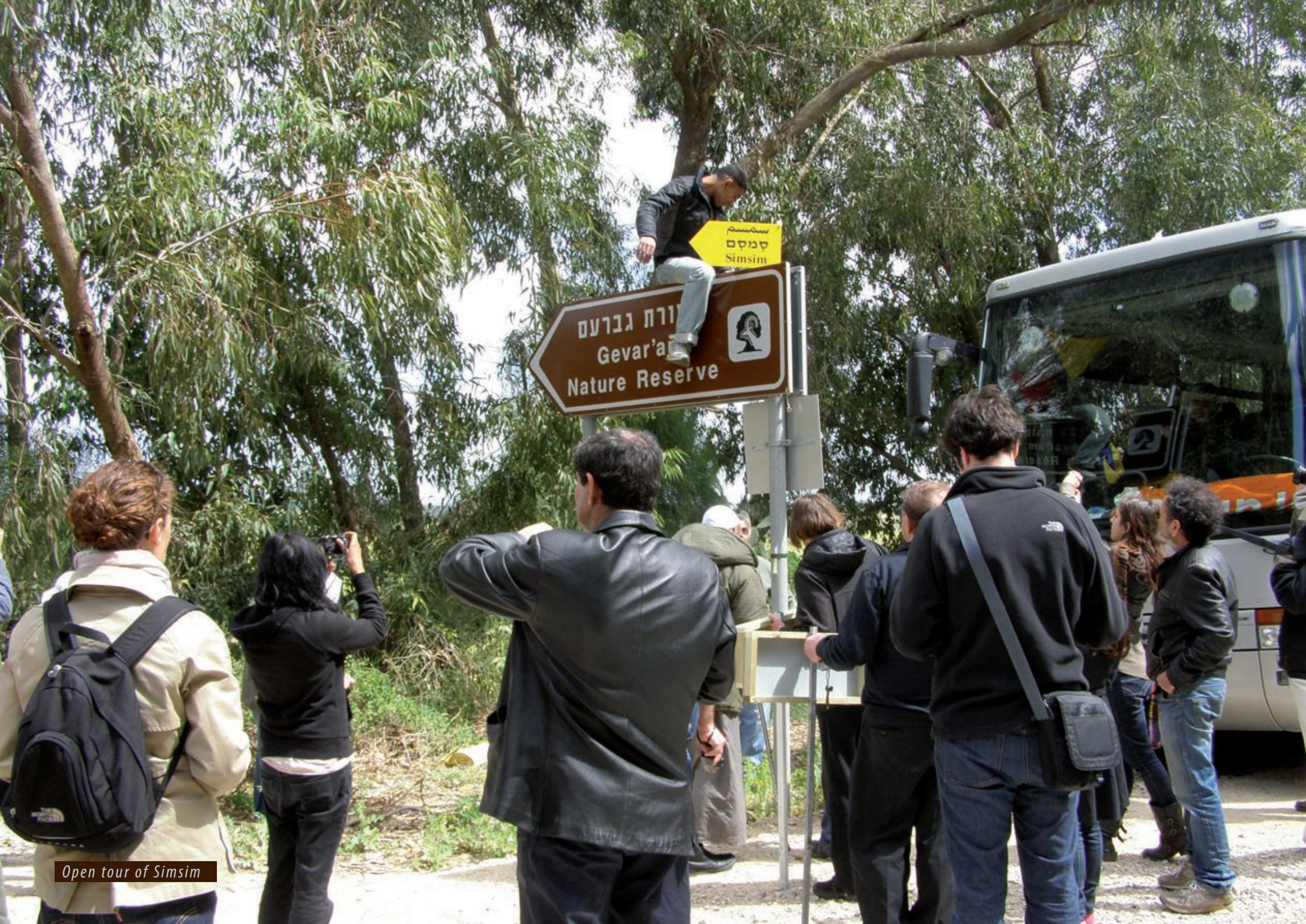
Open tour of Sinsim