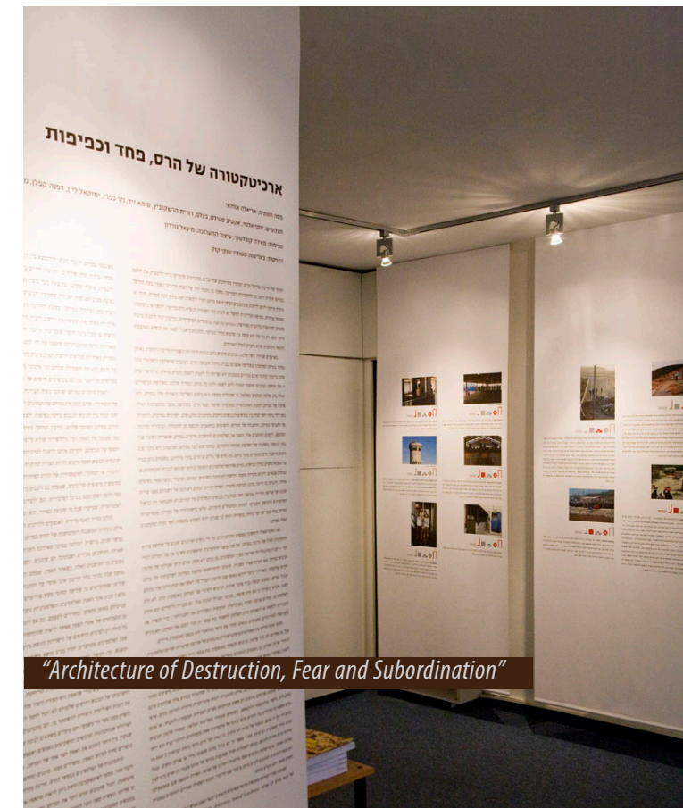
"Architecture of Destruction, Fear and Subordination"

About 500 people took part in exhibition openings and gallery talks. At least twice that number viewed the exhibitions [photo]. The gallery and exhibitions were mentioned a number of times in the on-line and printed media.