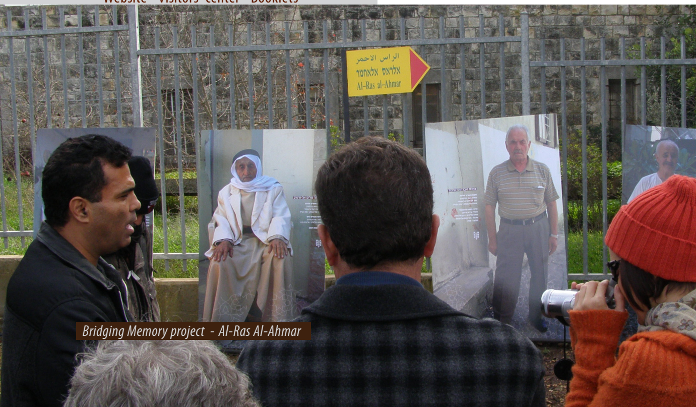
Bridging Memory project - Al-Ras Al-Ahmar